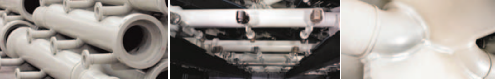
Fig. from left to right: Pre-fabricated nozzle lance components; assembled nozzle level; extrusion weld seams of nozzle outlets