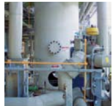
Cylindrical tank made of SIMONA® PVC-C CORZAN Industrial Grade