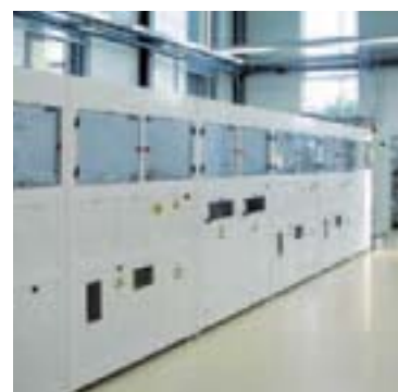
Wetbench made of SIMONA® PVC-C CORZAN FM 4910 G2