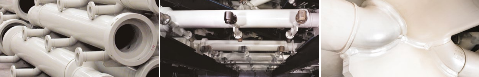
From left to right: Pre-fabricated nozzle lance components; assembled nozzle level; extrusion weld seams of nozzle outlets