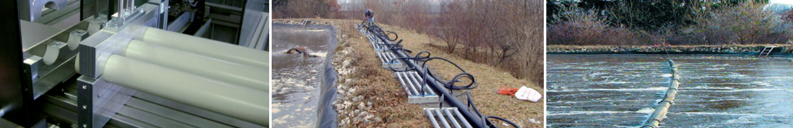
Fig. f.l.t.r.: Production of OXIWORKS® aerators; assembly of aerator lines; example of application