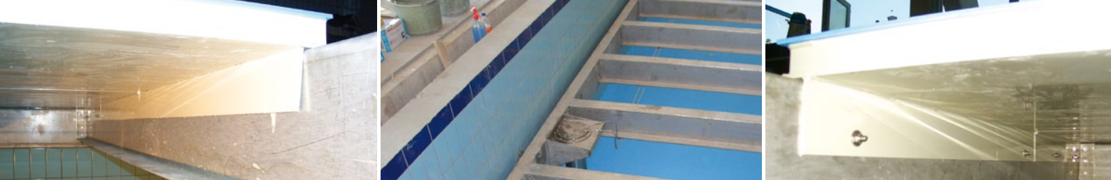
From left to right: Swimming pool floor welded to mounting panel, steel frame for hydraulic unit, bolted swimming pool floor.