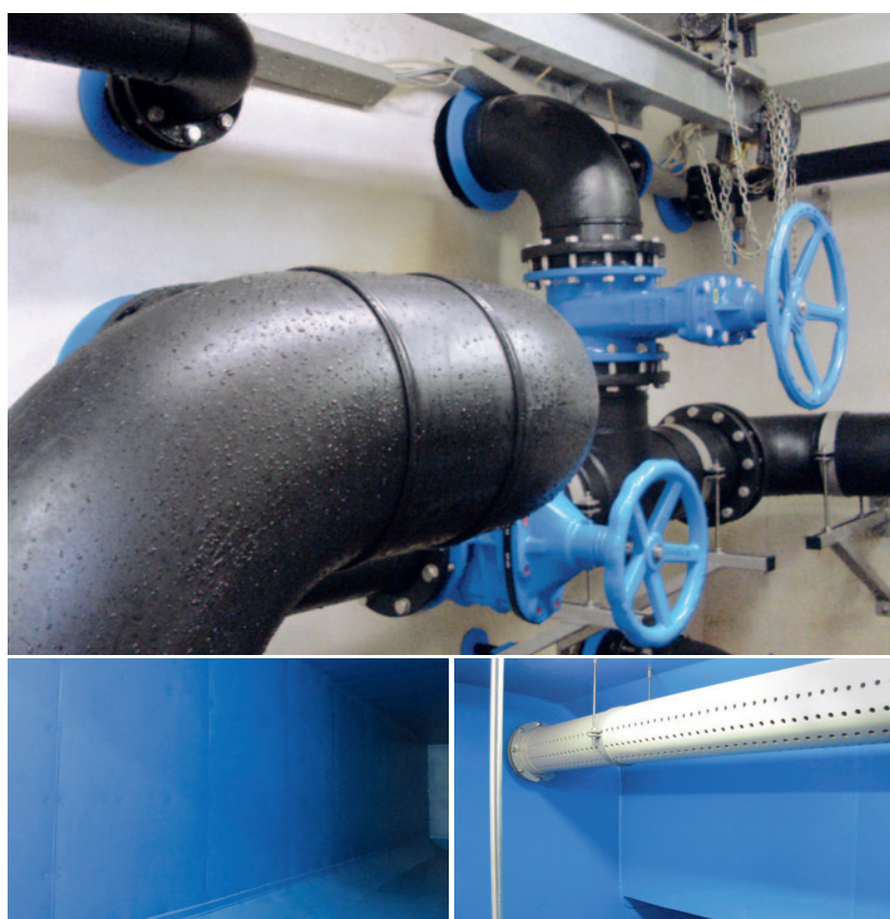
Top: PE piping system in the front chamber of the tank; Bottom: Elevated water tank lined with SIMONA® PE 340 sheets; Ventilation pipe made of SIMONA® PP-H AlphaPlus®

The Water Utilities Association of Untere Niddatal decided to renew a local elevated water tank in order to maintain the quality of drinking water well into the future. The chlorinated rubber with which the tank had been coated was beginning to peel off the interior walls, and the cement plaster was gradually disintegrating. Lined with SIMONA® PE sheets – light blue 340 –, the tank is now fit for purpose again and the quality of drinking water has been safeguarded for many years to come.