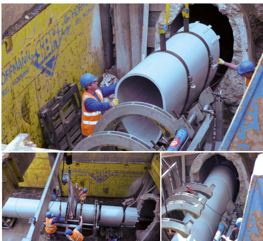
Top: introduction of the traction head for welding to the ovoid pipe train incl. spacers; bottom left: introduction of the face cutter and preparation for welding of traction head and ovoid pipe; bottom right: insertion of the ovoid pipe train

Over a total length of 580 m an ovoid sewer was renewed by means of the relining method as part of an external services development project for Göttingen University Medical Centre. SIMONA® PE Ovoid Pipes combine geometric benefits – high flow velocity for small quantities of water, improved discharge of large quantities of water – with the excellent material and processing properties of polyethylene. The customer-specific solution of using an ovoid pipe without any base enabled a high pipelaying rate and thus led to rapid completion of the construction project.